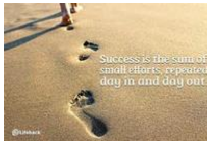
Dawn M. Sooy

GLVWG Yahoo Group Page: https://groups.yahoo.com/neo/groups/glvwg/info (Members Only)