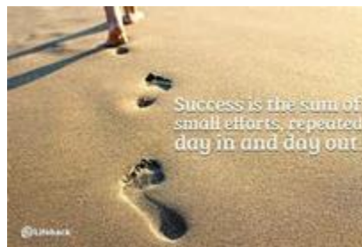
Dawn M. Sooy

GLVWG Yahoo Group Page: https://groups.yahoo.com/neo/groups/glvwg/info (Members Only)